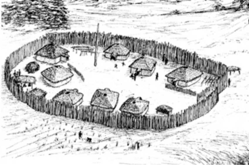
Yuchi Tribal Archive --- DKH